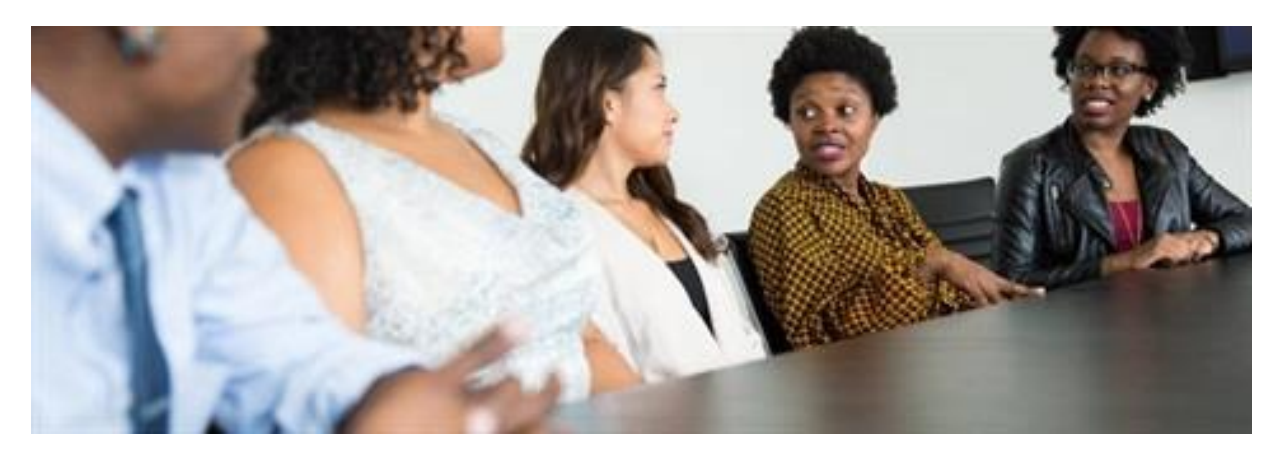
Is English your second language?

Meet other adults who are learning English and practice your English speaking and listening skills in a relaxed and safe environment with our friendly library staff.