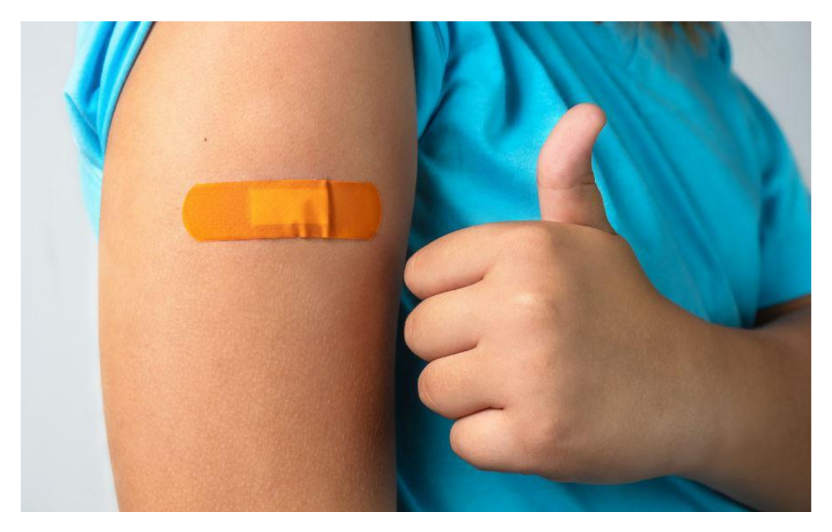
Did you know the Yarra Ranges Council provides a FREE Community Immunisation Service?

Vaccines funded by the National Immunisation Program are provided FREE.